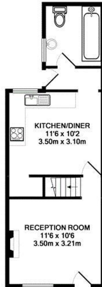
GROUND FLOOR APPROX. FLOOR AREA 31.7 SQ.M. (341 SQ.FT.)