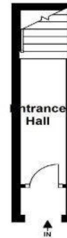
Ground Floor Entrance