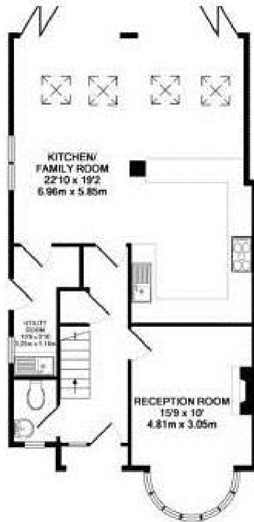
GROUND FLOOR APPROX. FLOOR AREA 717 SQ. FT. (66.4 SQ. M.)

ORMOND DRIVE TW12 TOTAL APPROX. FLOOR AREA 1455 SQ. FT. (135.2 SQ. M.)