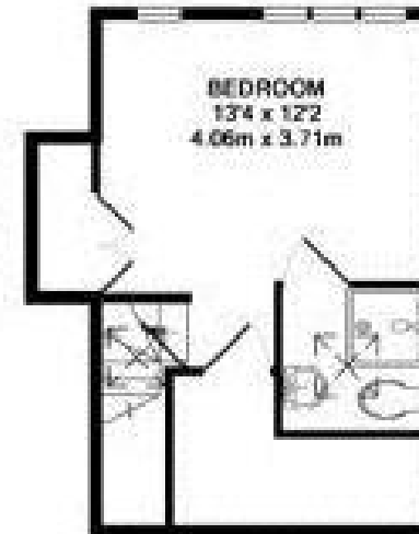
2ND FLOOR APPROX. FLOOR AREA 257 SQ. FT. (23.9 SQ. M.)

a Websters Estate Agents 36 Broad Street, Teddington, Middlesex TW11 8QY