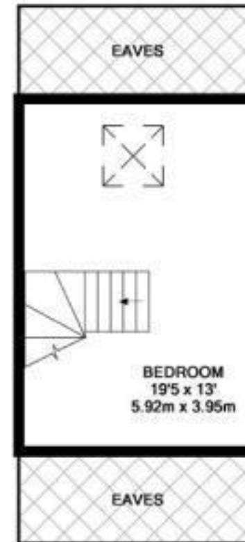
2ND FLOOR APPROX. FLOOR AREA 249 SQ. FT. (23.1 SQ. M.)

NORCUTT MEWS, TW2 TOTAL APPROX. FLOOR AREA 1084 SQ. FT. (100.7 SQ. M.)