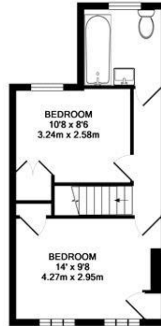
1ST FLOOR APPROX. FLOOR AREA 356 SQ. FT. (33.1 SQ. M.)

WARWICK ROAD, TWICKENHAM, TW2 6SW TOTAL APPROX. FLOOR AREA 761 SQ. FT. (70.7 SQ. M.)